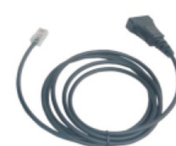
KSPL-05 Programming cable

NOTICE: The specifications may be subject to change without notice due to advancement in technology, for more detailed information, please contact Shenzhen KIRISUN Electronics Co., Ltd.