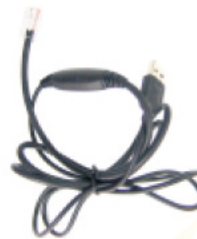
KSPL-U05 Programming cable